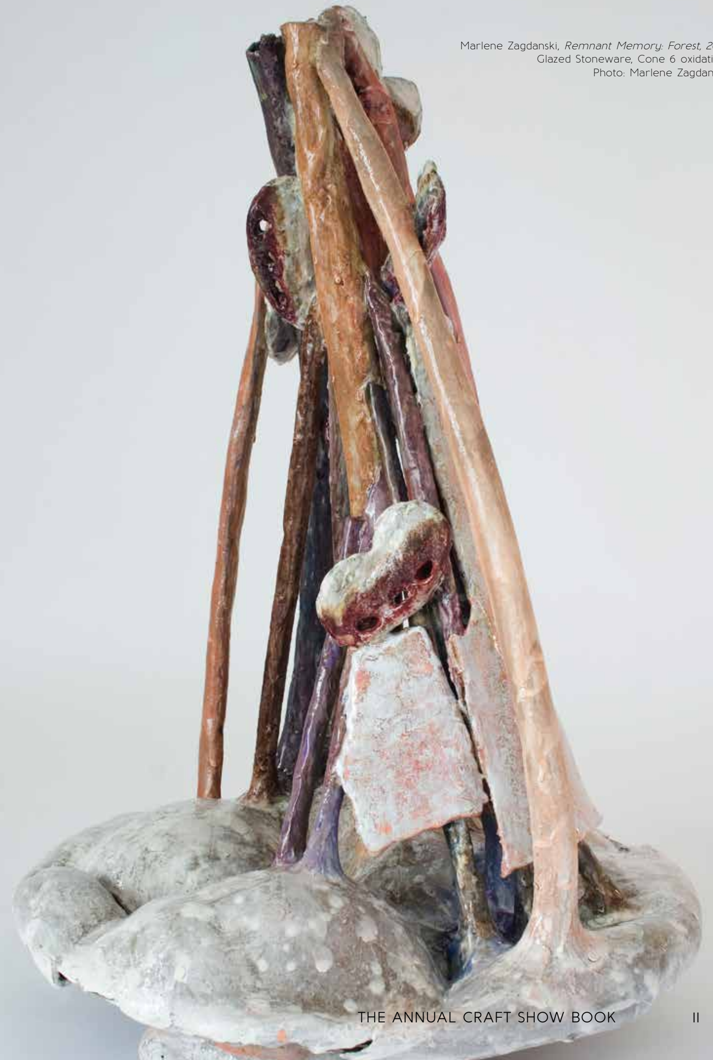
Marlene Zagdanski, Remnant Memory: Forest , 2015 Glazed Stoneware, Cone 6 oxidation

Show Location and Details: City Park Corner of King St East & West St Kingston, Ontario K7L 2Z7