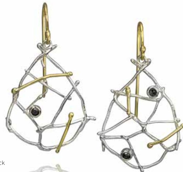
Andrée Chenier, Nest Earrings . Fused sterling silver, 18k gold wire and black diamonds.

The Thornhill Village Festival is a non-juried, outdoor show, specializing in crafts and heritage. Applications are available from March 1, 2016 to August 15, 2016. Manufactured items are accepted and non-Canadian items are accepted. Booth sizes start at 10' x 10'.