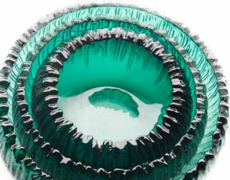
Courtney Downman, Three Saw Carved Shallow Nesting Bowls , 2015