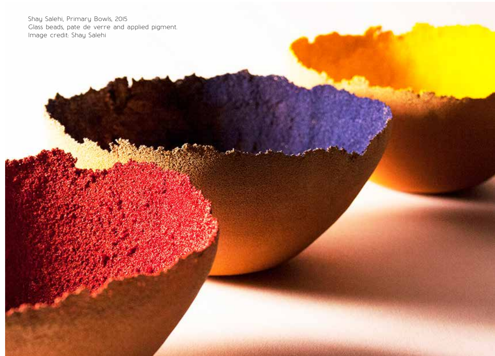
Shay Salehi, Primary Bowls, 2015 Glass beads, pate de verre and applied pigment.