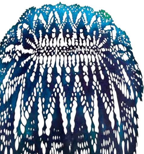
Lizz Aston, Exploding Lace View – Warp #1, 2013. Kozo paper and fibre- reactive dyes, hand-cut