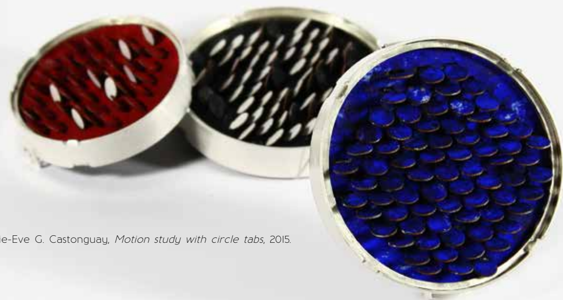
Marie-Eve G. Castonguay, Motion study with circle tabs , 2015.

Show Contact: Kevin Silver Show Phone Number: 519-274-4466 Show Email: hiho.silver@sympatico.ca