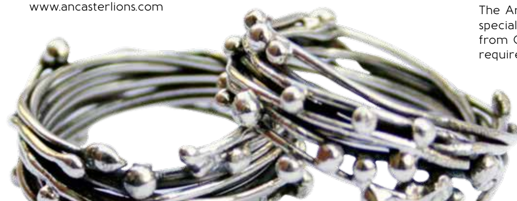
Elizabete Ludviks, Rings , 2013. Sterling silver.