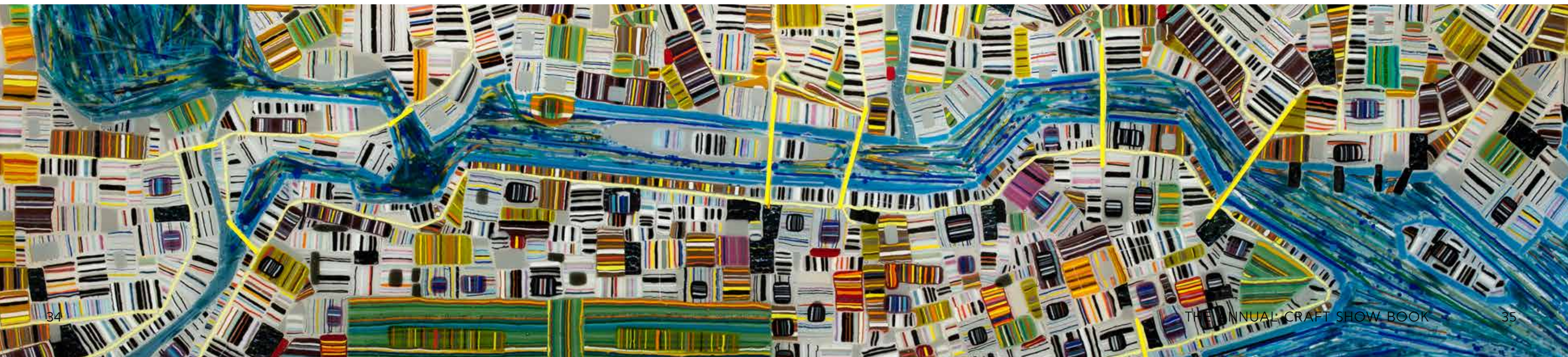
Renato Foti, Retro Mesh series # 2 in B & W 's, 2015 Fused & slumped glass.